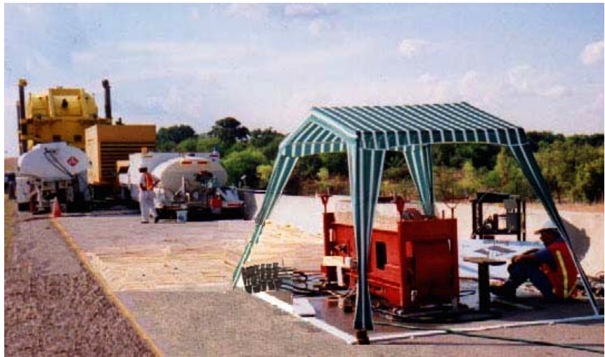
Figure 2 Overview of the two APT Devices

For simplicity, the \alpha and \beta factors were initially set to equal 1. With the results from the increased tire pressure tests, it was found that the structural response was overemphasized, and \beta was changed to 0.5. This value satisfied the equation.