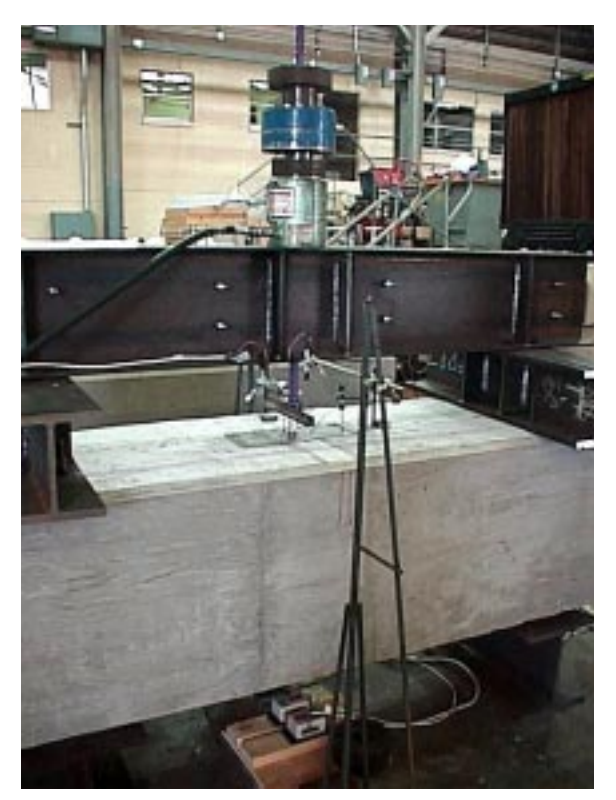
Figure 2 - Setup for Phase 1 Pullout Testspecimens were designed and de-<br/>tailed by the research team and<br/>TxDOT bridge design engineers.were made<br/>sions. The<br/>provided fFabrication and testing was carried<br/>out by Champagne-Webber at its<br/>construction facility in Houston,<br/>Texas.grout beha<br/>cedures tha