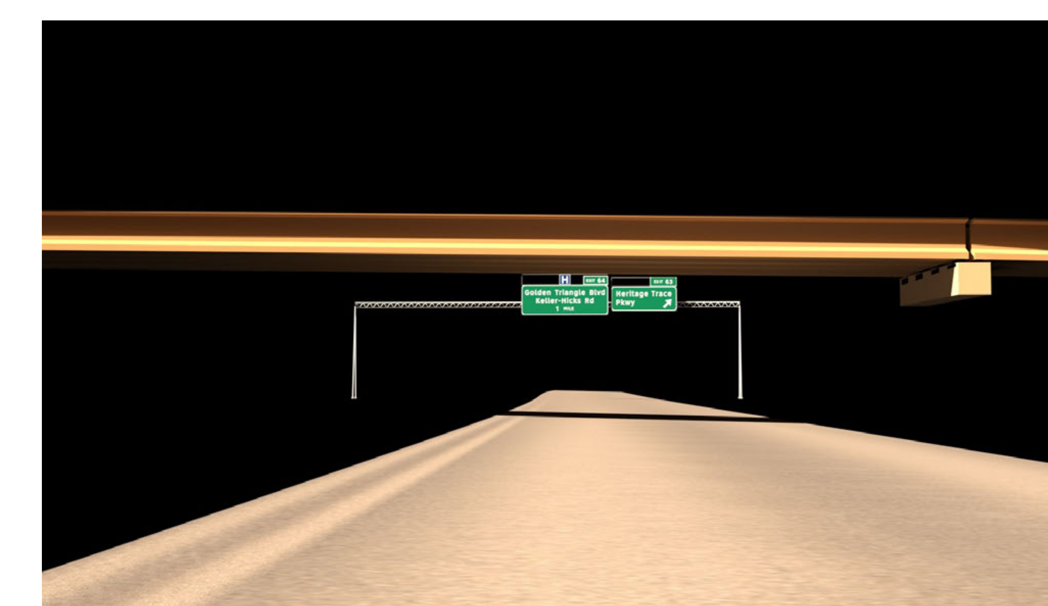
View of sign from 329 feet