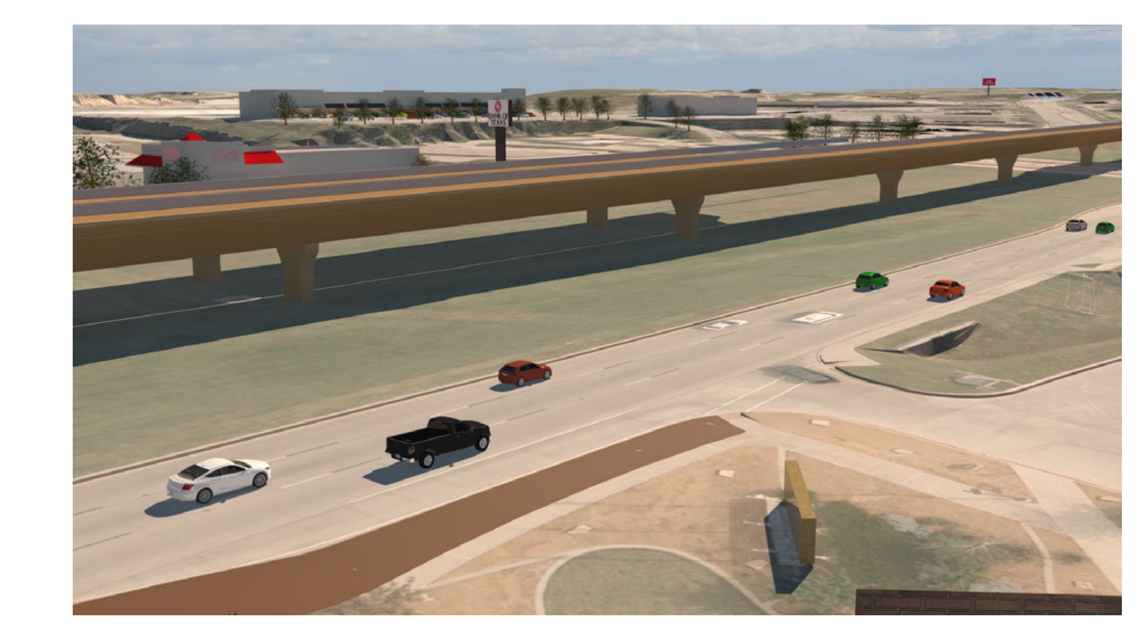
Segmental bridge shown from county courthouse

*A 360 degree view from a car's perspective for both bridges is HERE .