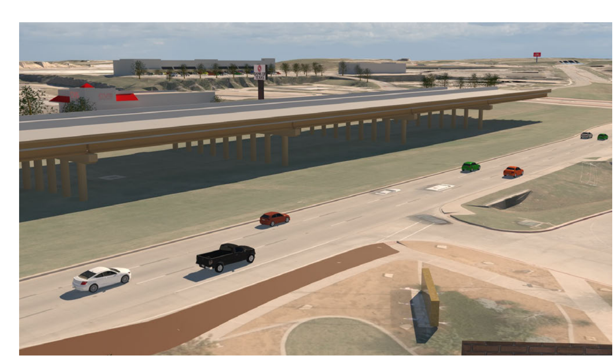
TX Girder bridge shown from county courthouse