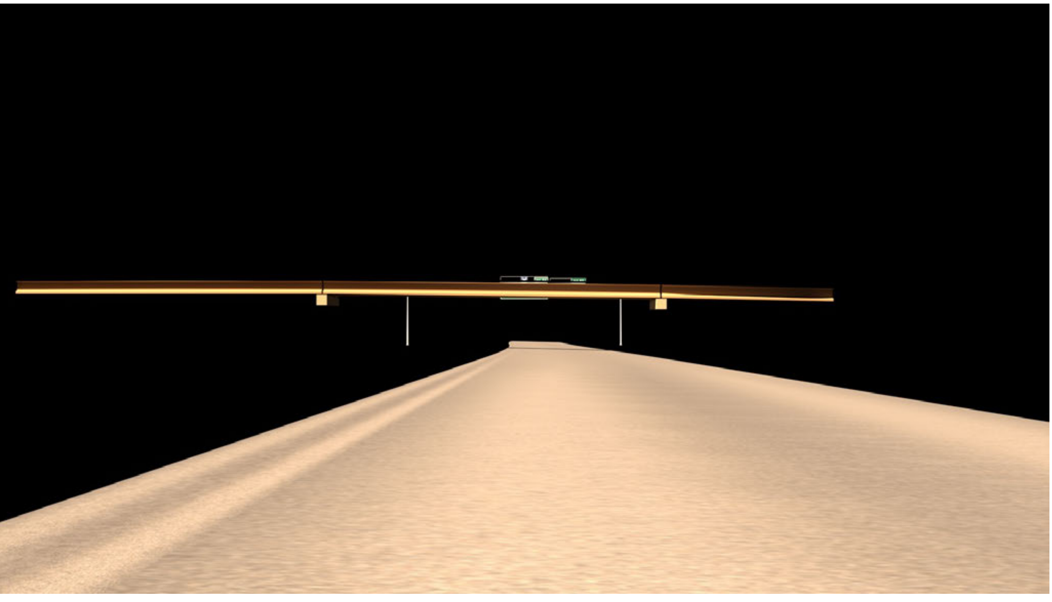
View of sign from 600 feet