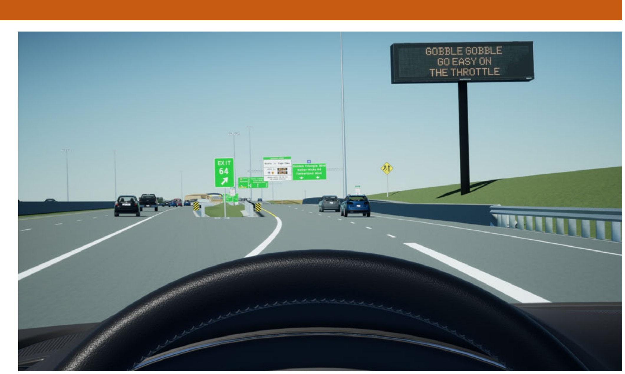
View along drive exiting highway to frontage road (click image to view video)